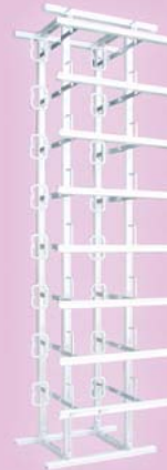
1024 E1 LTZF-FSF-DDF-1024E