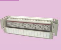
Digital Distribution Panel