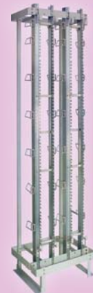
256 E1 LTZF-FSF-256E